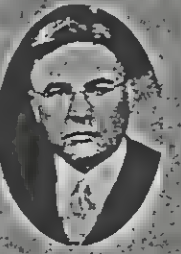
E. L. Morrison Education - Pk. Schools